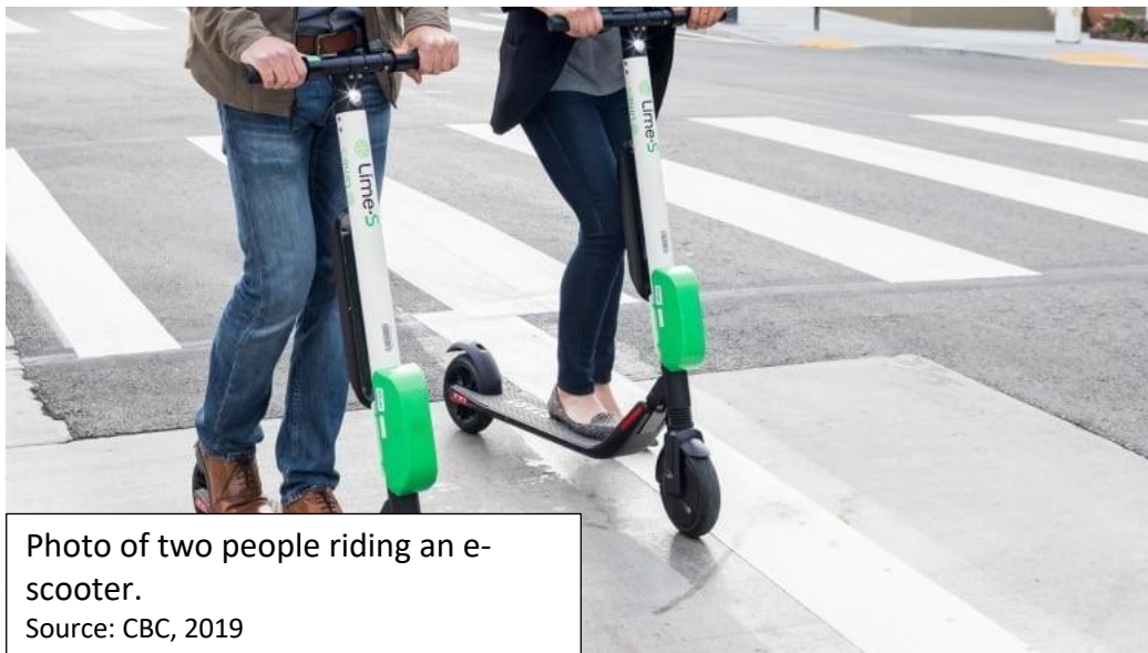
Photo of two people riding an e-scooter.