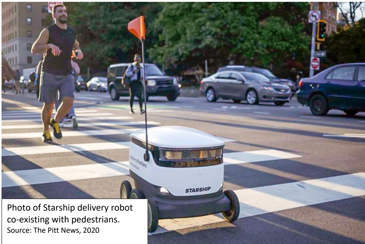
Photo of Starship delivery robot co-existing with pedestrians.

With the rise in popularity of online delivery services such as Skip the Dishes, Uber Eats and Amazon Prime, companies such as Amazon, Starship, FedEx and Uber are taking an innovative approach to the conventional human delivery service by developing, piloting and launching Personal Delivery Devices (PDDs) otherwise known as delivery robots in cities across the globe.